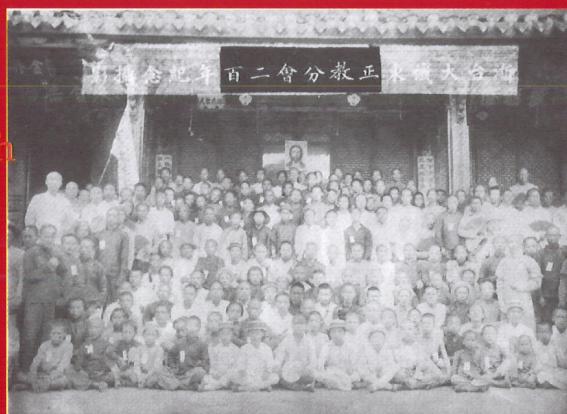
Chinese Orthodox faithful at Taizhou, Zhejiang celebrating the 200th anniversary of the Russian Mission

Ohrid by St. Nikolai (Velimirovich) of Ohrid and Zica, lectionary readings of the Holy Scripture appointed to be read throughout the liturgical year, and other basic Orthodox material.